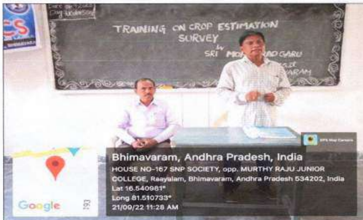
Training on Crop Estimation Survey

Explaining various aspects involved in Crop Estimation Survey