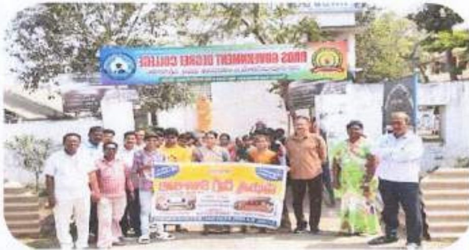
Students explaining the Junior College students about the facilities available in the college