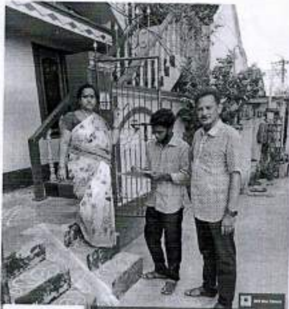
Mumbai Google Bhimavaram, Andhra Pradesh, India GGRM+60C, Nandamuri Vari St, Guntupudi, Bhimavaram, Andhra Pradesh 534201, India Lat 16.540142° Long 81.53461° 30/05/22 06:09 PM