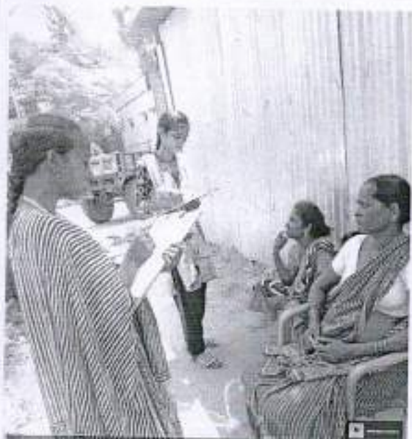
Bhimavaram, Andhra Pradesh, India GGMQ+GHS, Guntupudi, Bhimavaram, Andhra Pradesh 534244, India Lat 16.533522° Long 81.530998° 31/05/22 10:46 AM