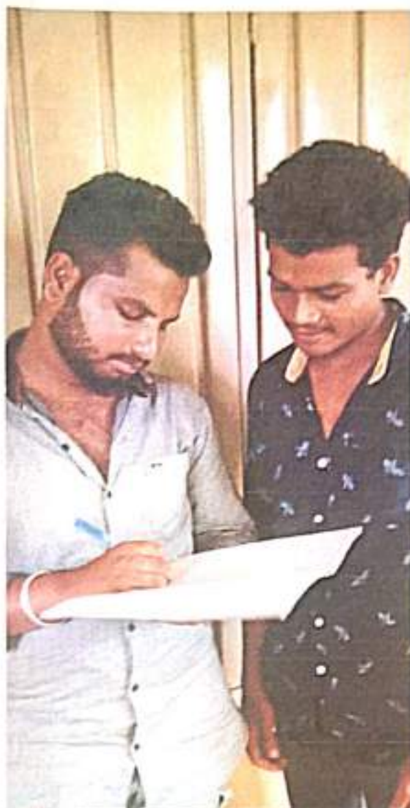
Bhimavaram, Andhra Pradesh GGR6+G9F, kalla Bhimavaram, Pradesh 534204, India Lat 16.541402° Long 81.510953° 26/07/22 01:34 PM