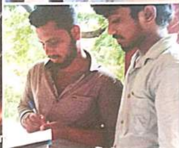
Bhimavaram, Andhra Pradesh, GGR6+HCV, kalla Bhimavaram, Andhra 534202, India Lat 16.541436° Long 81.510926° 26/07/22 01:33 PM