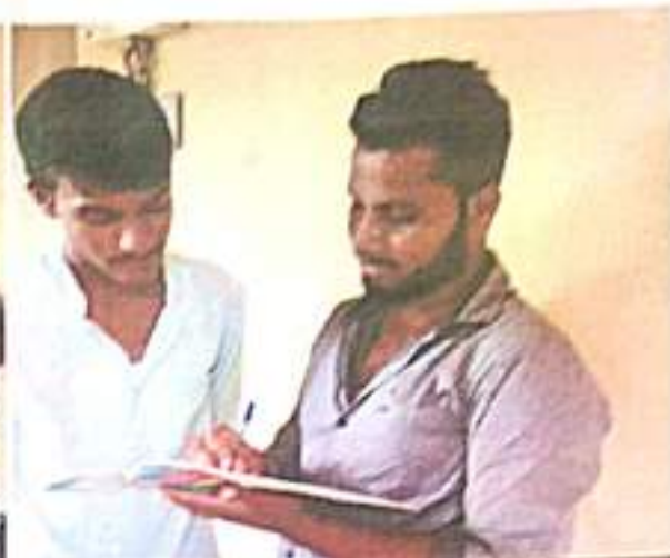
Bhimavaram, Andhra Pradesh, GGR6+G9F, kalla Bhimavaram, Andhra 534204, India Lat 16.541365° Long 81.510934° 26/07/22 01:32 PM